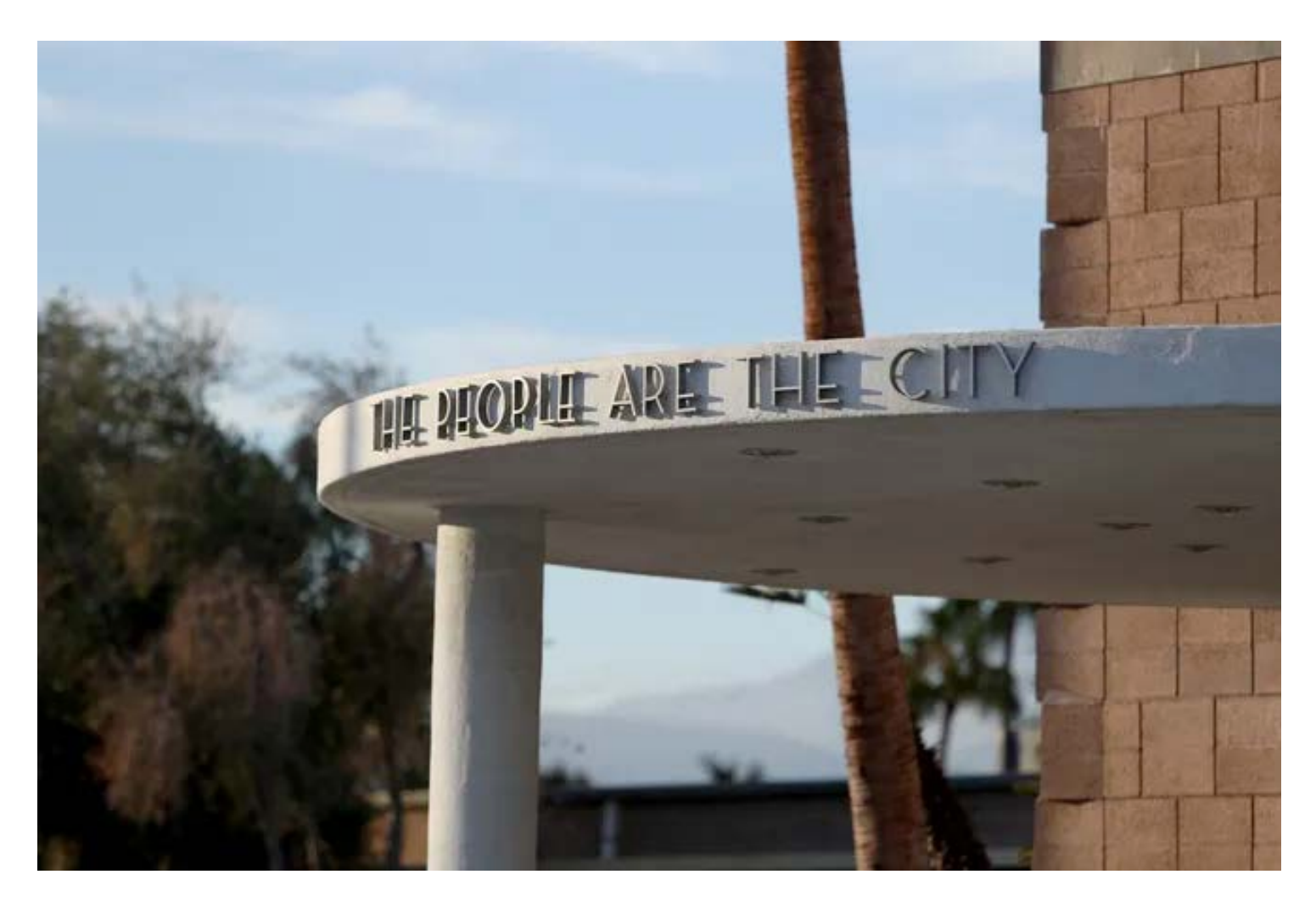
Palm Springs City Hall on November 14, 2024.